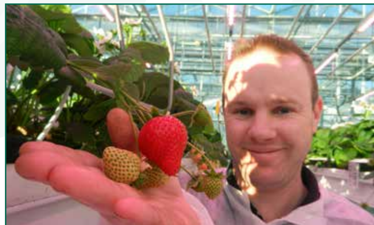
Production schedule Delizzimo® with grow lighting: plant-flower-fruit